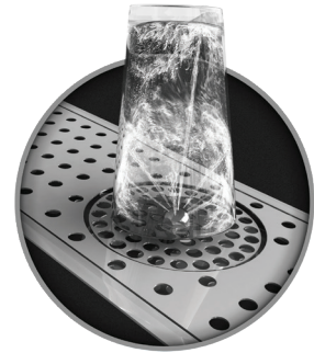
Integrated water glass rinser