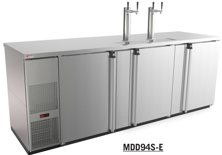
MDD94S-E Stainless Steel