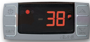
Adjustable Digital Thermostat! Easy to read exterior mounted